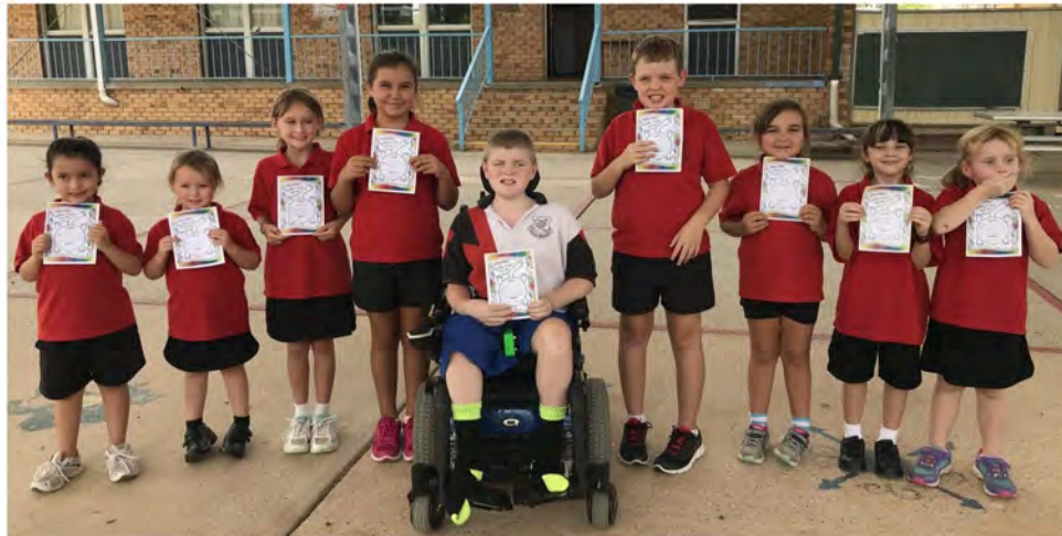
Quality Work Award