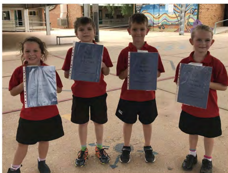
Student of the Week