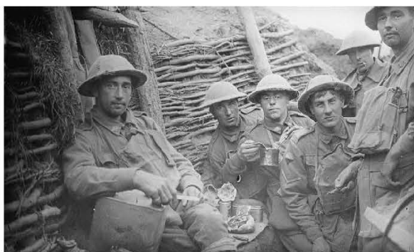
Australian 3rd Battalion at the Battle of the Menin Road at the Western Front, September 1917

Students are exploring the ancient world of Egypt in Stage Four History. Students will be mummifying tomatoes to replicate the process of mummification used for the Pharaohs and other wealthy Egyptians. At the other end of the schooling spectrum, Year 12 undertook their Ancient History HSC examination and felt well-prepared and generally confident in their ability to tackle the questions in the paper. Stage Five students are studying the causes and effects of World War One, and are being challenged to understand and memorise the political and geographical landscape of the time.